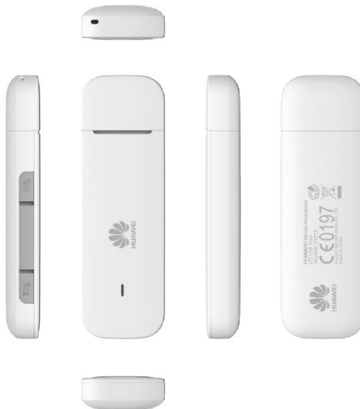
Figure 1-1 E3372s-153 profile